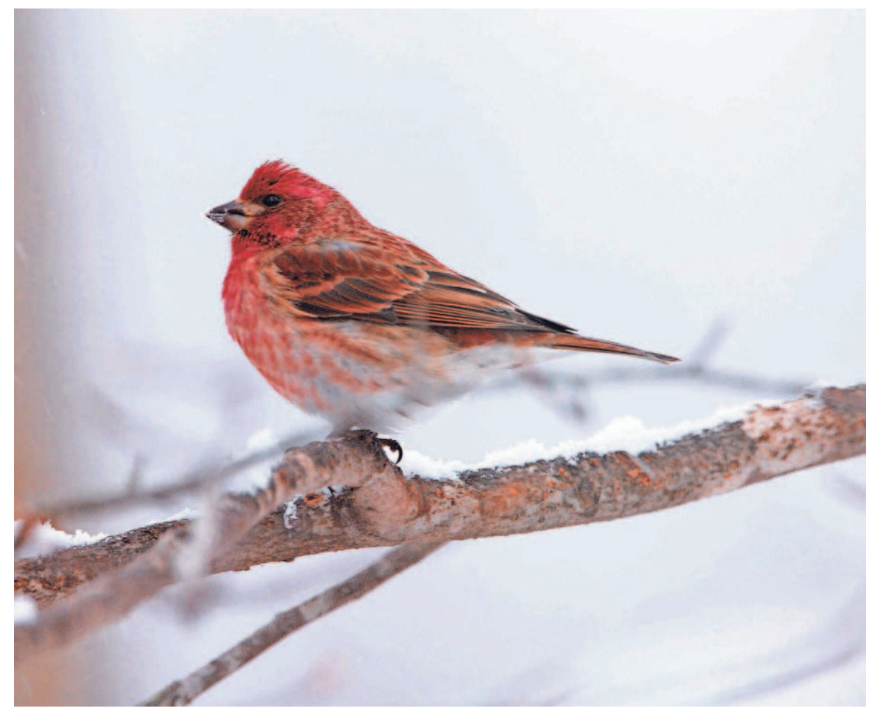
The purple finch is a seasonal migrant only found in the Smokies through the winter season. It is often seen feeding on seeds high in treetops.