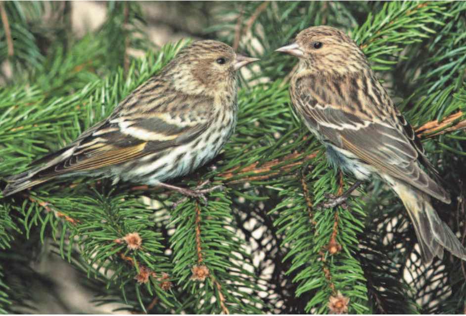
Pine siskins were among the species observed by volunteers at the most recent Christmas Bird Count conducted near Gatlinburg, Tennessee. They are most abundant and visible at lower elevations in winter.